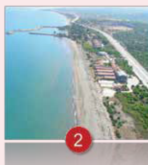
ERDEMLİ CAMPUS MERSİN (founded in 1975)