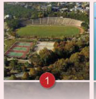
MAIN CAMPUS ANKARA (founded in 1956)

A comprehensive state university with three campuses: