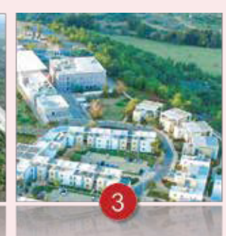
NORTHERN CYPRUS KALKANLI (founded in 2000)